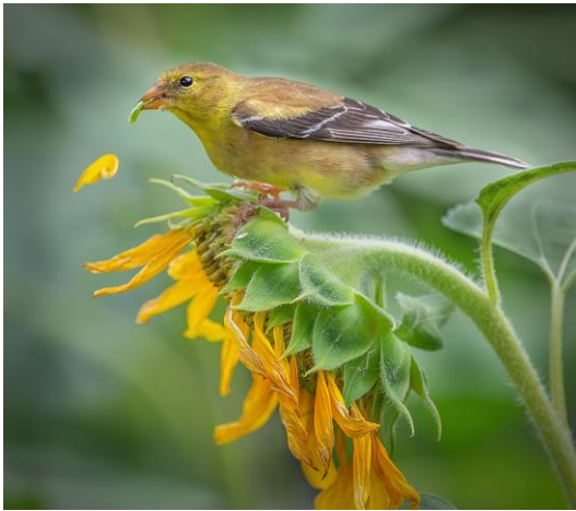
Open Category - Last Seed of the Season - Kathy Moore

Two Females Sharing was taken in British Columbia on a work shop with Gerlach Nature Photography in May of 2007. I used remote flash with settings of f18.0 at 1/250 and an ISO of 100. Nothing special was done in post processing.