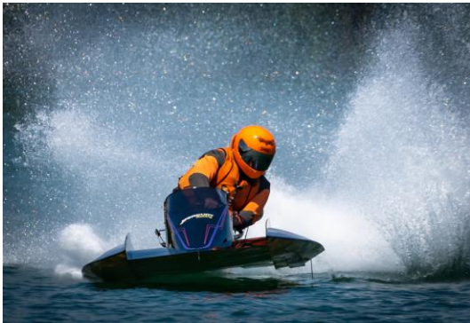
Open Category - On The Ragged Edge - Jonathan Neeld

This fall color image was taken just off the Kancamagus Highway in New Hampshire during a very light rain. I used a polarizer to cut down the glare on the leaves.