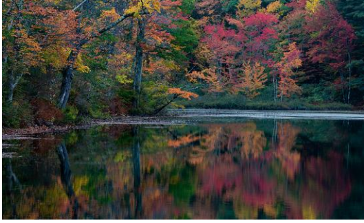
Open Category - NH Fall Color - Ed Ponikwia

This fall color image was taken just off the Kancamagus Highway in New Hampshire during a very light rain. I used a polarizer to cut down the glare on the leaves.